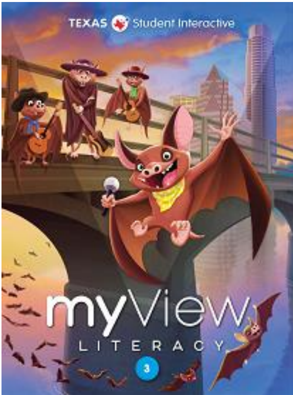
Texas myView Literacy