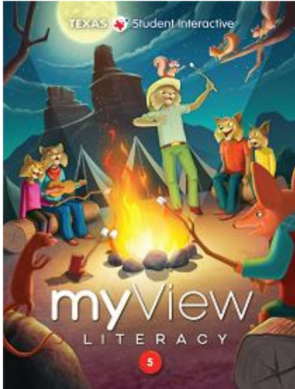
Texas myView Literacy