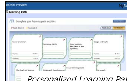
Personalized Learning Path