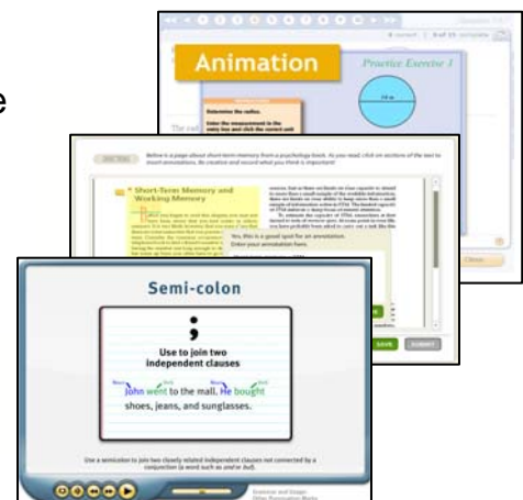
Thousands of Activities, Assessments & Learning Aids